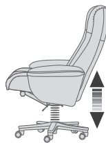
GAS LIFT SEAT HEIGHT ADJUSTMENT