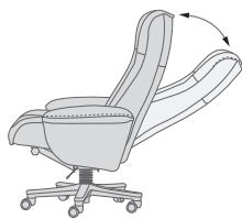
EFFORTLESS RECLINING MECHANISM