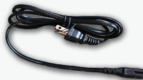
Power Cable X1