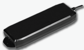
Power Supply X1